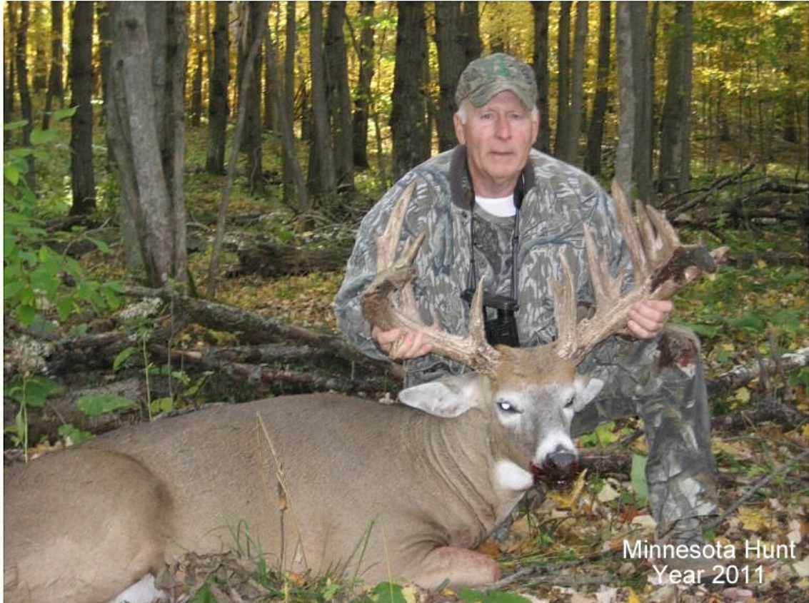
Big Whitetail - 23 Points - Weighed 307 lbs. - Scored 230 3/8