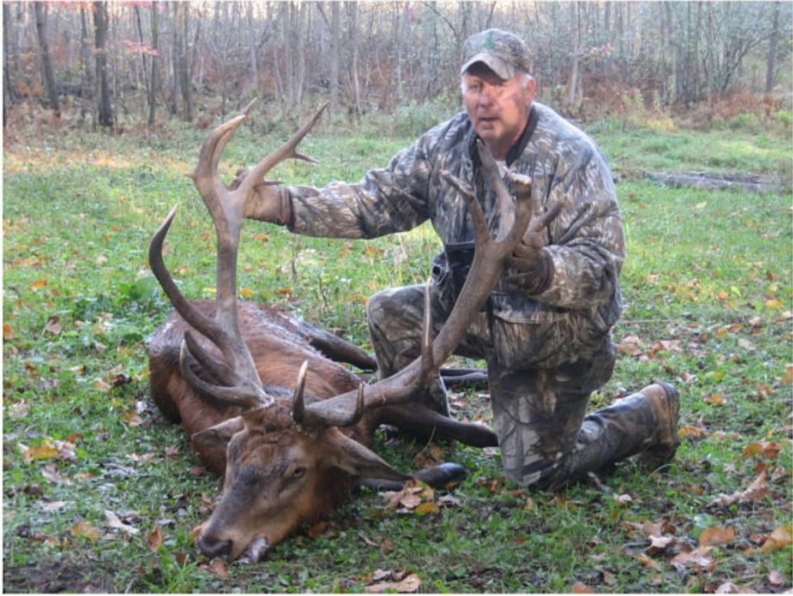
Red Stag-18 points. It is a silver medal stag